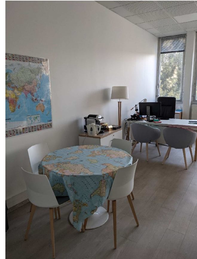
International office, faculty of Medicine, Sorbonne Université