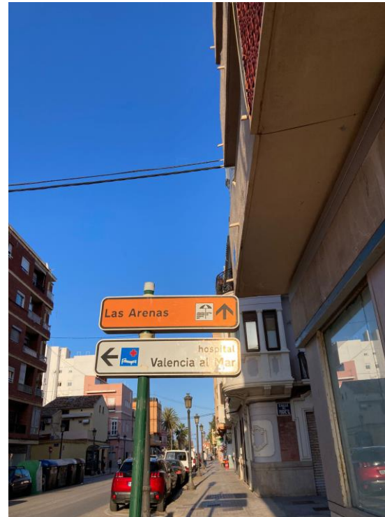
La playa de las Arenas